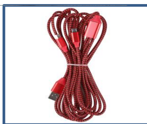
Foto del prodotto Picture of the item

L'oggetto descritto è conforme alla pertinente normativa di armonizzazione dell'Unione: The described object of the declaration is in conformity with the relevant Union harmonisation legislation: